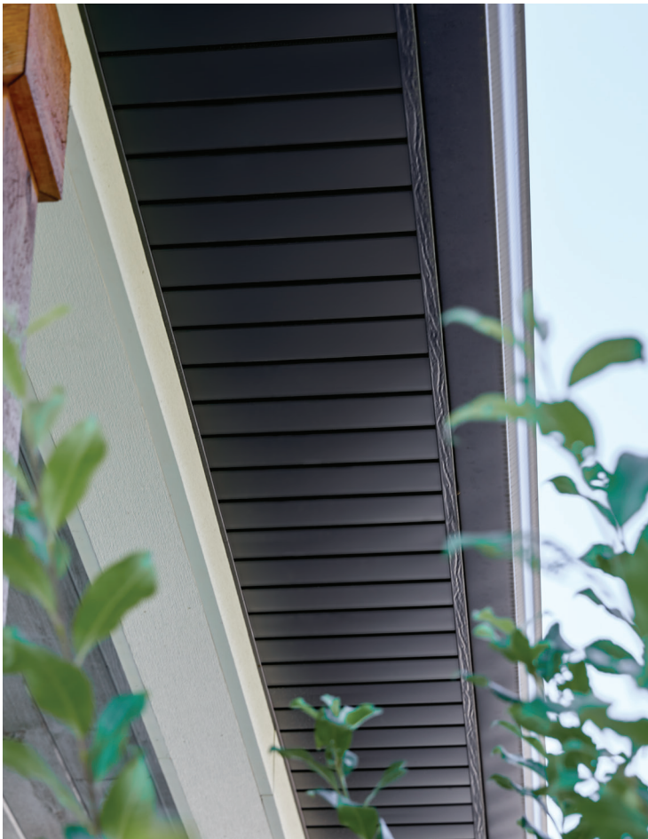
TruVent Hidden Vent Soffit in Black

TruVent changed the industry when it came to hidden vent soffit, creating the crisp, clean design of the angled vent system and did it again with the woodgrain soffit that complements any home design.