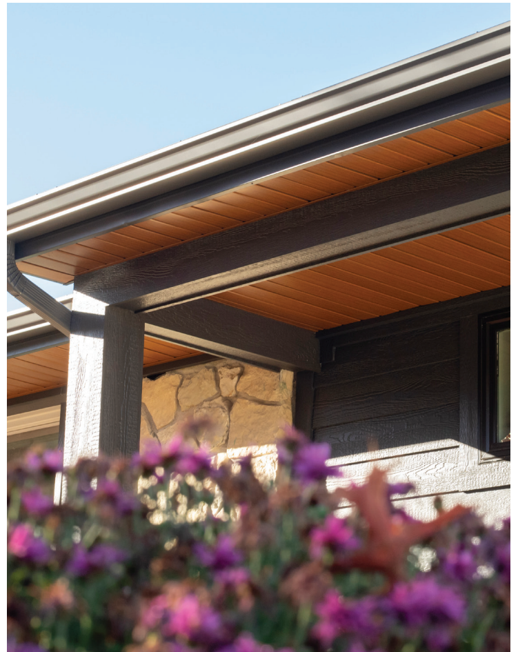
TruVent Hidden Vent Soffit in Medium Teak