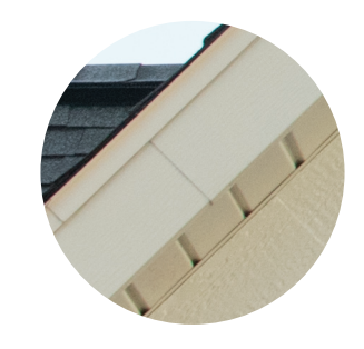
Fewer seams than trim coil. 10 ft lengths mean 20% less pieces and seams than trim coil.

Architectural Fascia uses a locking bracket to create a smooth, clean finish with no face nails. Architectural Fascia extends down 3/4" past soffit, creating a finished, inset look.