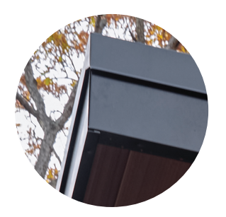
Both fascia styles are pre-engineered for better looking and faster applications.